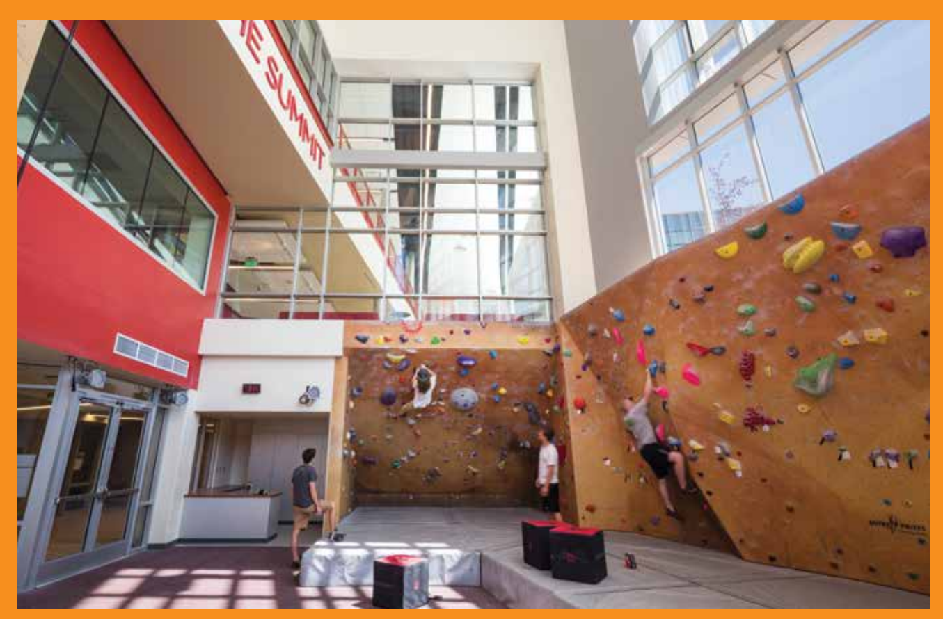
Left: 60-minute doors and storefront window with butt joint glazing Center: 60-minute curtainwall Right: Non-rated curtainwall

To learn more about the entire line of Aluflam fire-rated aluminum glazing systems, contact Aluflam North America at 562.926.9520 or email info@aluflam-usa.com . Or visit www.aluflam-usa.com .