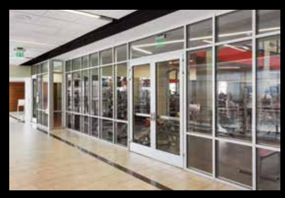
60-minute vision doors and curtainwall

When the University of Utah joined the PAC-12 in June 2010, the need to keep pace with other "big-time" conference schools was magnified. First, the university would have to upgrade its athletic facilities in addition to building other new world-class, state-of-the-art facilities as a way of bolstering the collective image of the entire 1,530 acre campus.